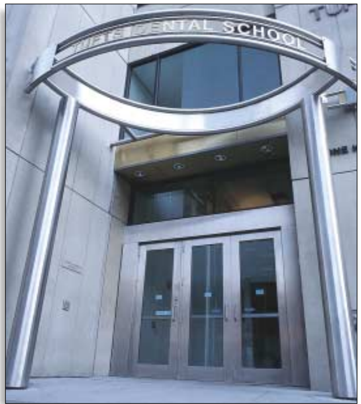
photo right Tufts School of Dentistry, Boston, Massachusetts

photo top right Georgia Pacific Corporate Office,